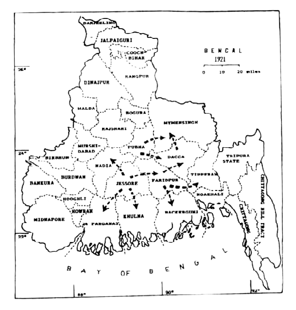
Figure 1: Distribution of the Kapali population throughout Bengal, according to Census of India 1921. (Arrows indicate mobility of the population, Mukherji et al. , '96)

The purpose of the present study is to report on a little known rural caste population of a village of West Bengal, with specific focus on their (a) the age and sex composition, (b) fertility, mortality and (c) and the changes that are taking place now.